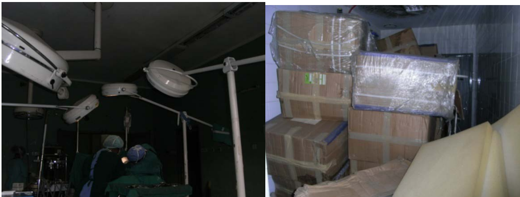
The lighting problems and the problems with resources to manage donations are shown in the about photos.