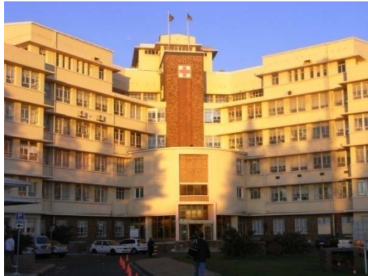
The Red Cross Children's Hospital, Cape Town. The location of the Paediatric Urology Workshop